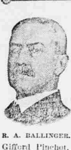
R. A. BALLINGER.

M ost lawyers never forget their first case, and if it is out of the ordinary, as frequently happens, they like to tell of it ever afterward. Here is how Secretary Ballinger, so much in the limelight just now on account of his controversy with Gifford Pinchot, tells of his first law case which he had at Kanab, Kan.