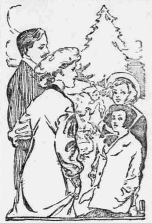
THE BEST FUN OF ALL.

and around after the little girl and the little boy driving their Christmas goose. The little boy and the little girl scattered corn and wheat and oats all over the ground around their Christmas tree. The chickens and the ducks and the guinea hens ate and ate and ate. The Christmas goose ate, too, but she ate very proudly and