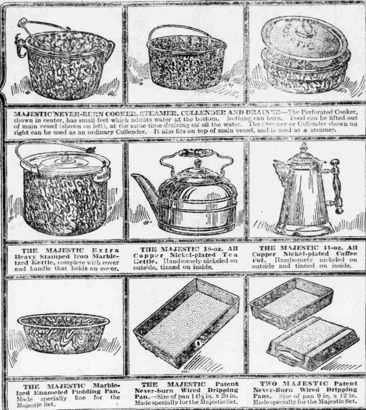
MAJESTIC NEVER-BURN COOKER, STEAMER, CULLENDER AND DRAINER —The Perforated Cooker, shown in center, has small feet which admits water at the bottom. Nothing can burn. Food can be lifted out of main vessel (shown on left), at the same time draining off all the water. The Steamer or Cullender shown on right can be used as an ordinary Cullender. It also fits on top of main vessel, and is used as a steamer.

THE GREAT AND GRAND MAJESTIC RANGE THE RANGE WITH A REPUTATION MADE IN ALL SIZES AND STYLES.