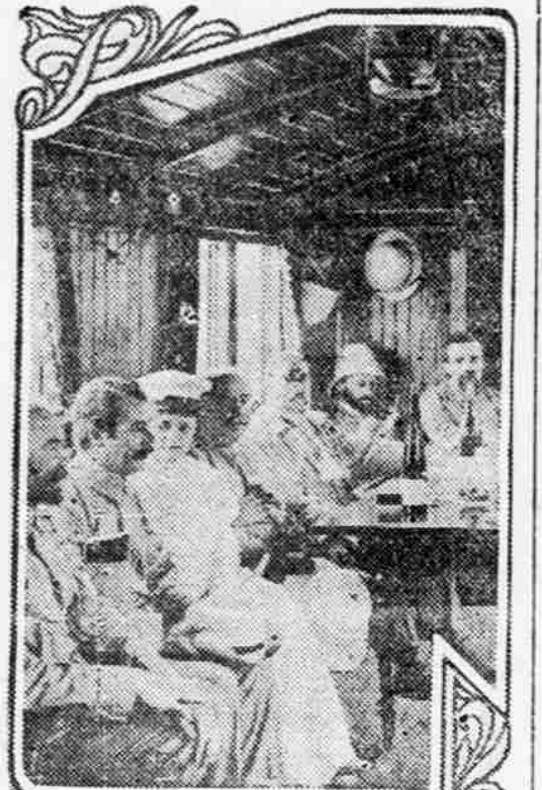
AFRICAN USAMBARA LINE.

Just at present there is a spirit of gayety among the invaders of the dark continent. They are trying to show that nothing is impossible to the enterprise of the twentieth century, whether it is bagging the fiercest animals of the jungle for amusement venders in mobiles, harnessing the falls of the Zambezi, scaling the heights of the Rurailway. Conquest of the continent and