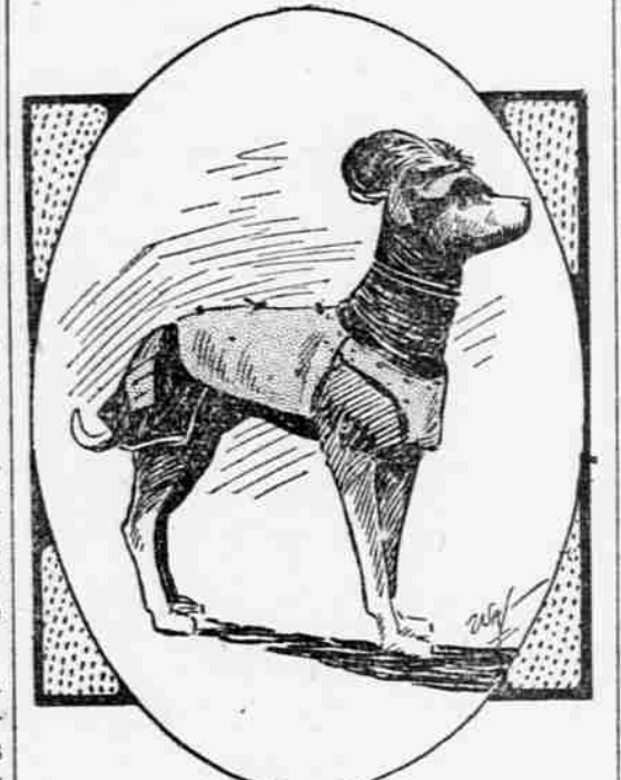
Armor for Hounds of Old.

painted with his finest greyhound clad in handsomely wrought gold armor standing by his side. The expert's brother collectors, who had suggested surgical appliances and all sorts of queer things as a solution of the puzzle, were somewhat chagrined when they learned its true use. At present this odd armor is on exhibition in the royal collection at Madrid.