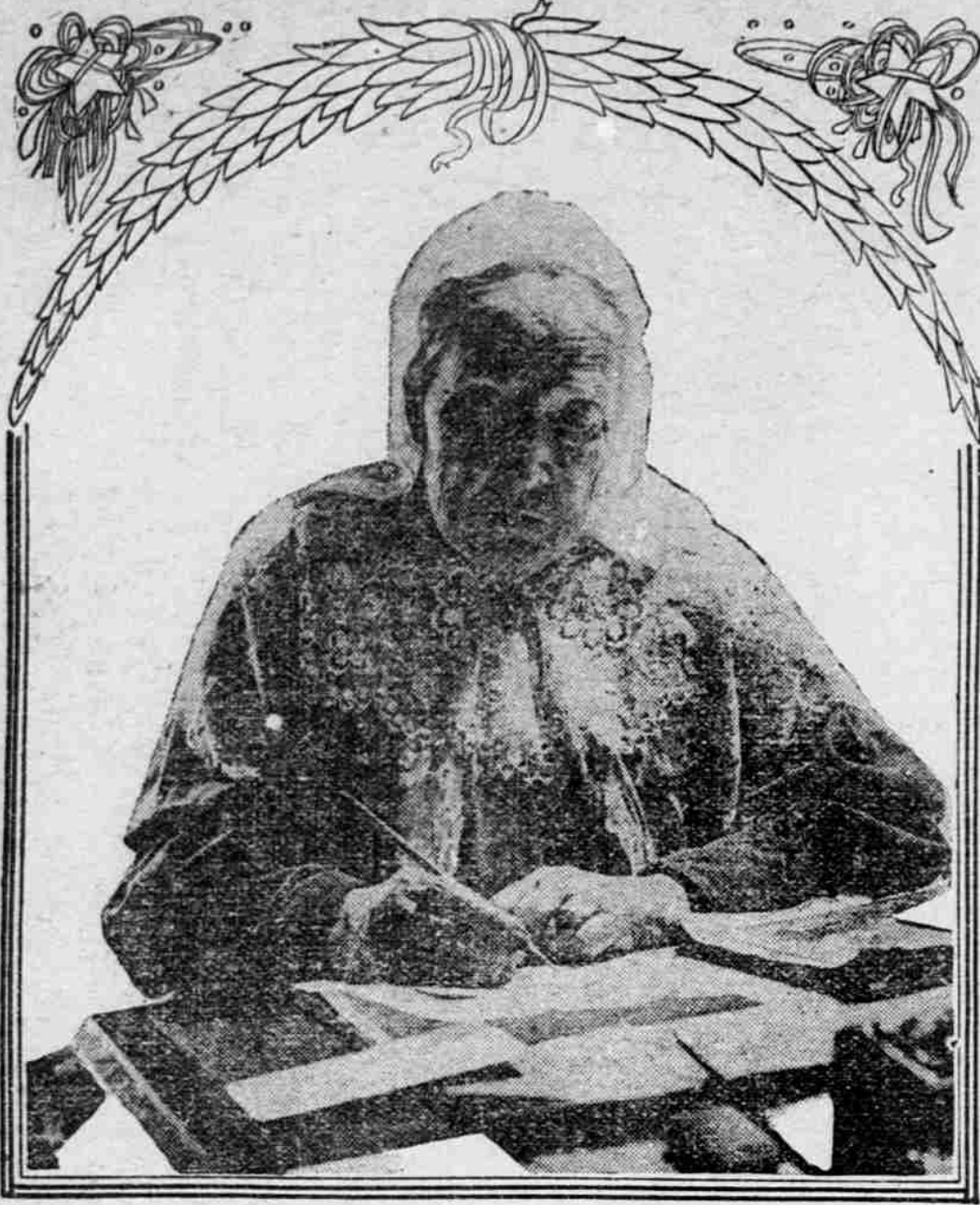
Latest portrait of one of the most famous women in America, taken at her home at Newport, R. I.