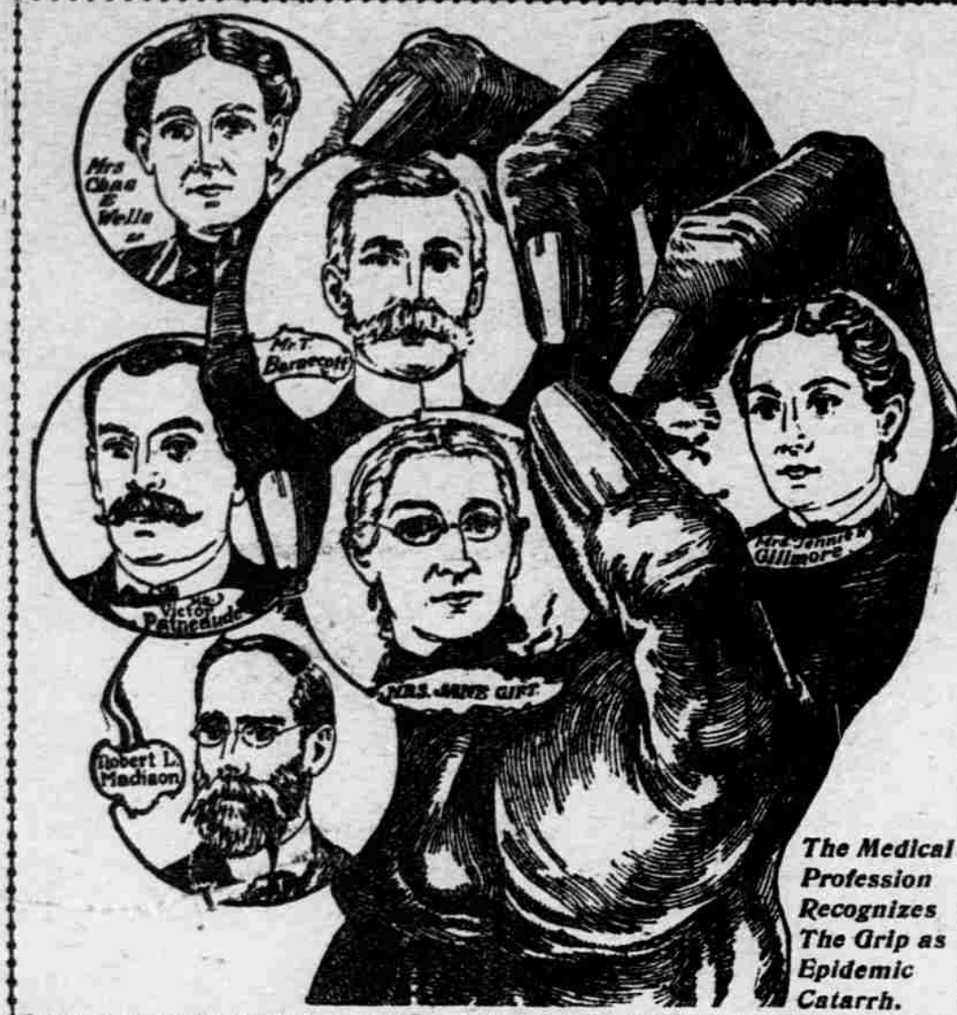
The Medical Profession Recognizes The Grip as Epidemic Catarrh.