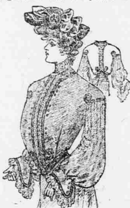
4686 Eton Jacket, 22 to 40 bust.

The jacket is made with fronts and back and is fitted by means of single darts, shoulder and under-arm seams. The little vest can be applied over the edge and finished with the braid, or the jacket can be cut away and the edge of the vest arranged under it, then stitched to position. The sleeves are gathered and are joined to the