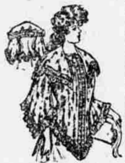
4643 House Jacket, 32 to 42 bust.

House Jacket. House jackets are possessions of which no woman ever yet had too great a variety. This one is made with a slightly open neck and loose sleeves that are much to be desired from the standpoint of comfort as well as beauty. The model is made of flowered challie trimmed with lace, but is well adapted to all the pretty washable fabrics in vogue. The big collar is a feature and gives the long, drooping shoulder line which so completely marks the season.