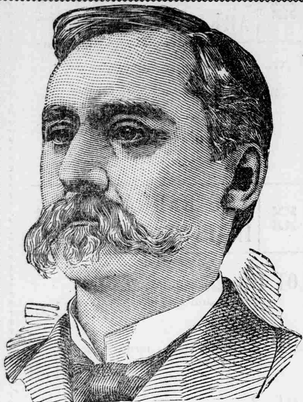
Hon. W. N. Roach, United States Senator from North Dakota.

SAYS THAT PE-RU-NA, THE CATARRH CURE, GIVES STRENGTH AND APPETITE.