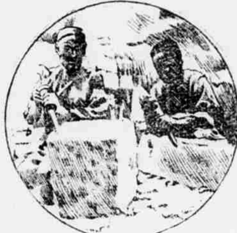
THE STONE CUTTERS.

How needful is economy may be judged from a few figures. Unskilled laborers are paid upon an average 7c a day. Masons, carpenters and stone cutters, here as elsewhere the aristocracy of labor, get from 25c to 30c a