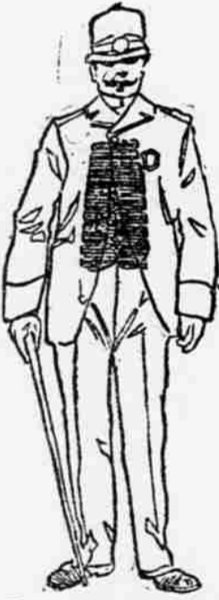
How Philadelphia Policemen Keep Cool.

The wives of the policemen of Philadelphia devised a plan for keeping their husbands cool during the hot weather the other day. It, at least, illustrates how the ingenuity of a woman may make light of official rules, even though they be those of a municipal police department.