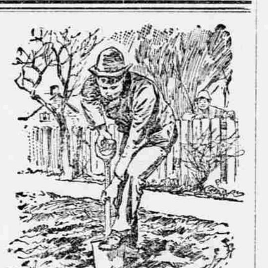
The Man Who Toils

HANN'S PHARMACY, 18th and Farnam, 5-12-13 Omaha, Neb.