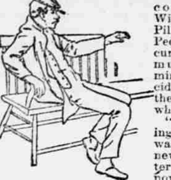
A Wounded Soldier.