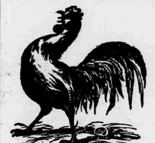
FOR JOSEPH SPOTTS—92.