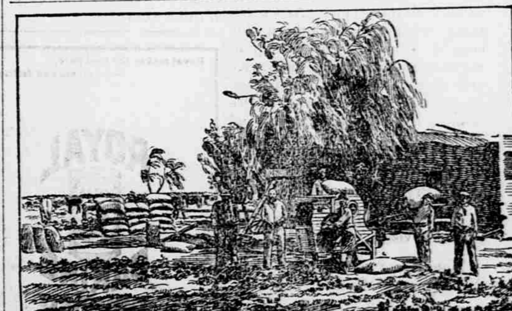
SANTA FE—ITALIAN COLONISTS CLEANING WHEAT.

Ex-Candidate Bryan seems to be of the impression that he and silver are THE Democratic party. Despite the fact that such time honored and experienced leaders as Senator Gorman and Chairman Jones and others, who were active in political life before Bryan was born, have urged the abandonment of the silver issues in New York, Mr. Bryan has written a letter urging just the reverse of this. In that letter he insists that the Democrats of Greater New York should, and indeed must, endorse the national platform, which, of course, means the free and unlimited coinage of silver at the ratio of 16 to 1 without the consent or co-operation of any other nation; also renomination of William Jennings Bryan in the year of our Lord 1900—particularly the latter. It is understood in inner Demo-