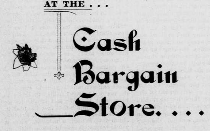
C. L. DEGROFF & CO.

Blankets, Yarns, Canton Flannels, Dress Goods, Underwear, Muslins, Sheetings. Etc. Prices are made to suit the times. Watch our corner for bargains this month. The 20 per cent discount still on in our clothing department.