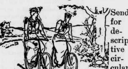
Ladies ride Columbias.