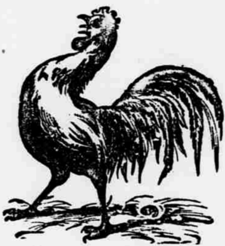
Reducing the Surplus.

Advertising is one of the undemonstrable sciences of the present day. Many business firms who expend thousands of dollars every year in advertising cannot sit down at the end of the year and figure out the exact medium through which they received returns from a single dollar of the money expended in that way. In fact, it is sometimes a debatable question whether ordinary advertising pays at all, or not, and the only way for a business man to determine as to its value is to try doing business without advertising. But the man who is accustomed to advertising doesn't withdraw his patronage from the newspaper for any length of time. He soon notices a gradual dropping off in his business, which can be attributed to nothing else than the withdrawal of his advertising. The people of to-day have become so accustomed to watching for advertisements that they have acquired the habit to patronize firms which advertise, and they are apt to regard with suspicion business men who do not advertise.