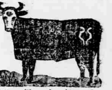
The Turnip Brand.

McCook, Neb., range: Red Willow creek in southwest corner of Frontier county. Also, E brand on right hip and side and swallow-fork in right ear. Horses branded "E" on right hip. A few branded "A" on right hip. 4