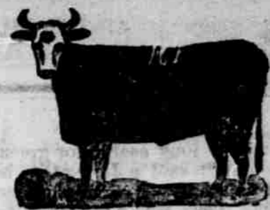
C. D. PHELPS.

In Red Willow County, Nebraska, has been surveyed, and lots in the market for just one year and has now a population of 1000 people. This point has been designated by the C. B. & Q. as the DIVISION STATION between the MISSOURI RIVER & DENVER, where the principal shops, a 15 stall round house and other R. E. facilities have been located on the Denver Line. A complete system of water works costing $25,000 is just being completed giving all the facilities for comfort possessed of old cities. Lots will range in price from $150 to $500 for business lots, and $50 to $200 for residence lots. The history of points like McCook show an increase of more than three hundred per cent. in from one to five years, and this town promises to be an exceptional chance for investments. For further particulars apply to R. O. PHILLIPS, Or W. F. WALLACE, Secretary, Lincoln, Neb. McCook, Nebraska.