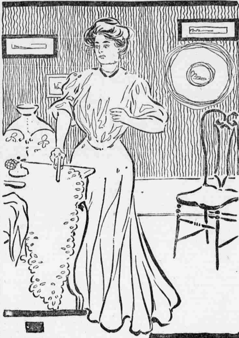
"One Look Was All I Needed."