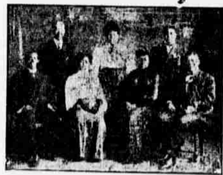
ALEXANDER'S JUBILEE SINGERS Alexander's Jubilee Singers

Five big musical attractions, six entertainers, and nine lecturers. If you buy a season ticket this great array costs about six cents for each entertainment.