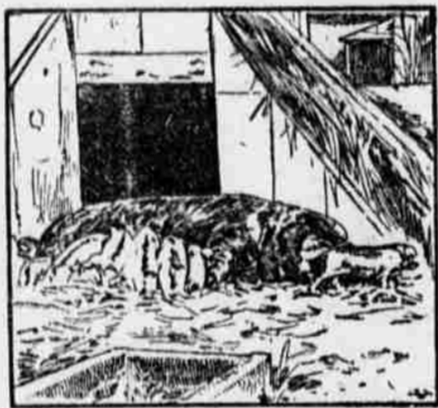
FIG. XXVII—THERE IS NO FOOD BETTER THAN MILK FOR YOUNG ANIMALS.

Every animal must have a certain amount of roughage; otherwise the grain would lie in the stomach in a heavy, sodden mass, which could hardly be penetrated by the digestive juices, and indigestion would be sure to result. The crude fiber, while indigestible in itself, dilutes the more concentrated feeds and greatly hastens the process of digestion. The ruminants are able to obtain a large share of their feed from roughage. Horses use considerable, though owing to their smaller stomach they cannot use as large quantities as cattle do. Swine are usually regarded as grain eating animals, yet they, too, do better for having some roughage. Mature hogs will maintain themselves on a good rape or clover pasture without any grain at all, and fattening swine will make greater gain if fed on pasture.