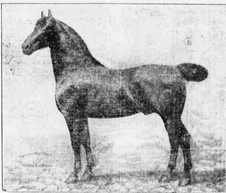
"SPITFIRE" THE HIGH ACTING ROAD STALLION.

$15 to Insure Mare in Foal. $18 to Insure Colt to Stand and Suck.