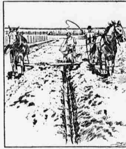
FIG. IX.—COVERING THE TILE DITCH.

Fields with a clay subsoil withstand dry weather much better than those with a subsoil of sand or gravel. The latter, because of their looser texture,