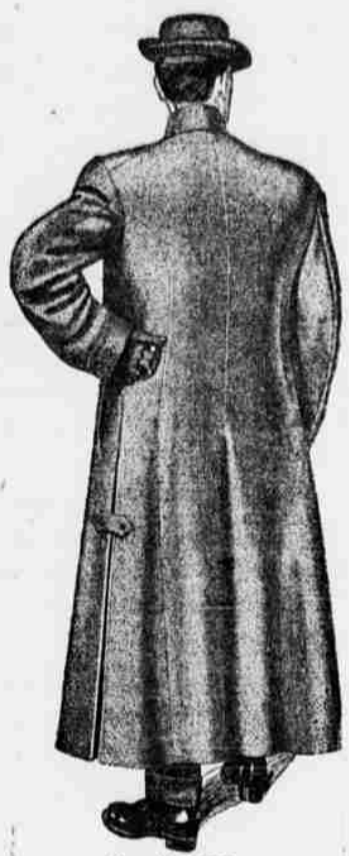
Copyright 1908 The House of Kuppenheimer Chicago

The last word in Style, The best word in QUALITY