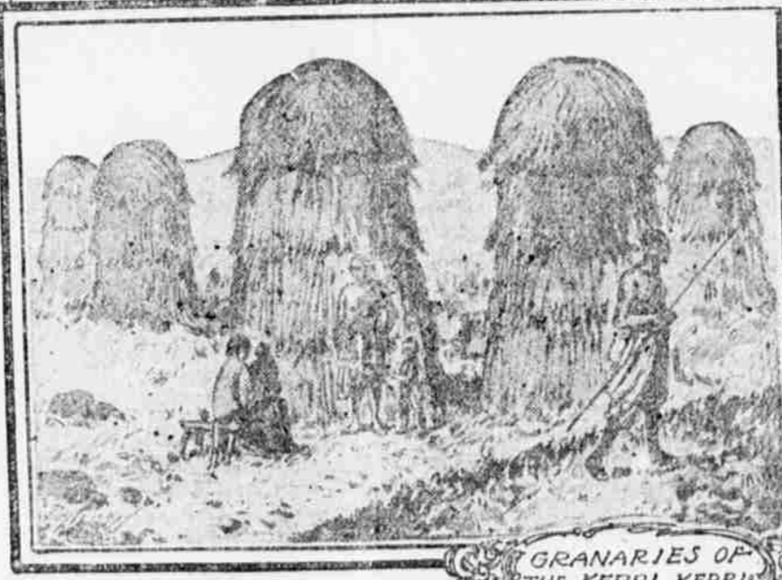
GRANARIES OF THE KERRI-KERRI

The habits of the jungle disbanded and went their ways, the party in power determined that the only living ex-president, when he became such, should not get the upper hand when he made his visit to Africa in search of game and the opposing minority determined to keep one eye on Roosevelt and the other on King Leo's bunch. Bear shooting in the canebrakes of Louisiana or trailing Bruin in the Rockies is tame sport alongside of that which Theodore Roosevelt will find in East Africa when he goes there after his term of office expires. It will be necessary to take over 100 men on the hunting expedition, if he goes after all the big game to be found, and, judging from what the cartoonists say about him, it will be his purpose to deplete the fastnesses of the dark continent to the greatest possible extent. How will he