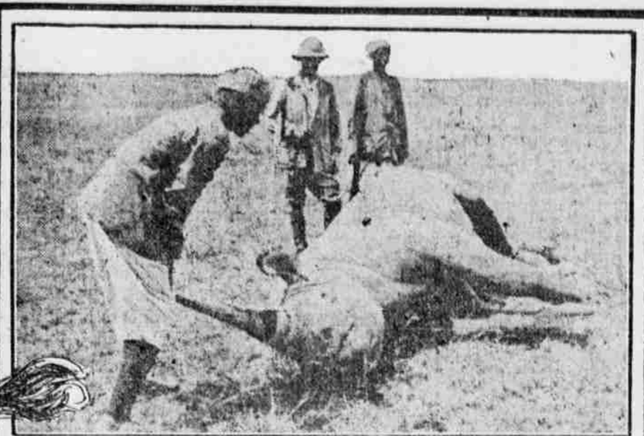
LUCKY SHOT AT MR. RHINO WADING THROUGH THE MUD IN SEARCH OF WATER