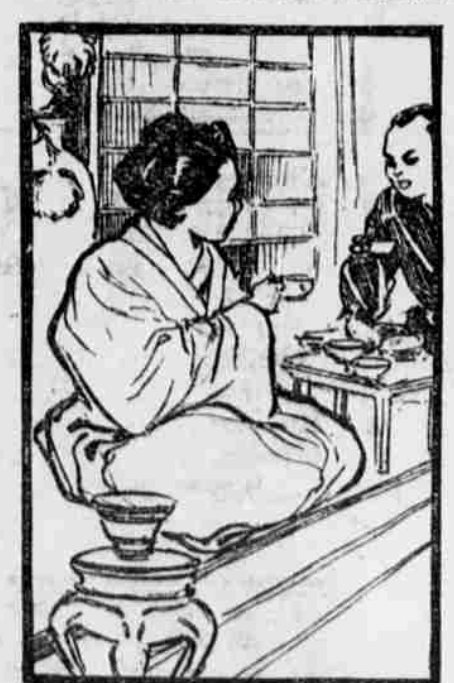
The Rite Which Makas Them Man and Wife.

The flowing veil of the western bride is, for the Japanese woman, a