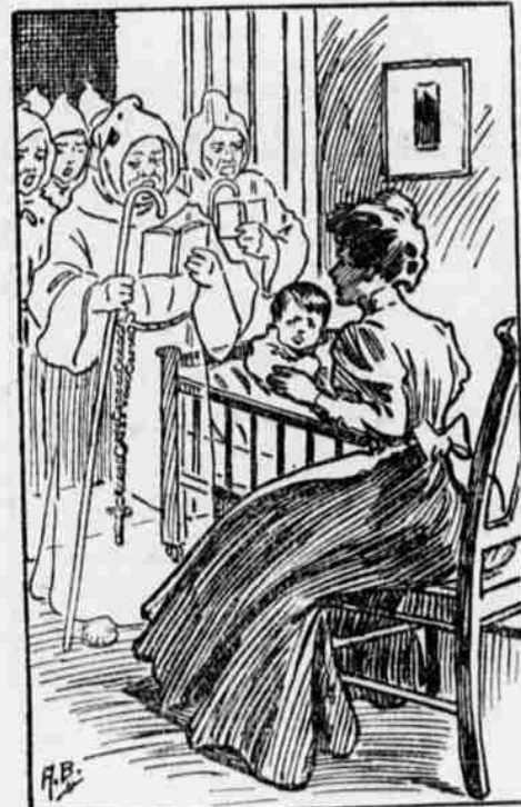
Cowled Monks Went Through the Room.

My stepmother said it reminded her of something she had heard at a thea-