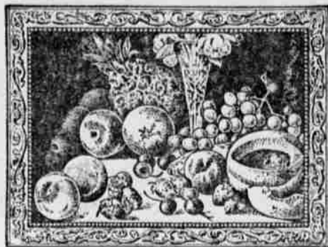
"NATURE'S GOODIES"—One of the beautiful facsimile framed pictures which will be sent to you.

Look at the picture of the magnificent monogram dinner set on this page. 100,000 of the prize sets are going to be distributed free, and every one of our readers can have one of these sets free by doing a good turn for a friend of mine Geo. Clark.