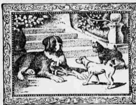
"SAVED"—The other beautiful picture which will be sent to you for you to keep.