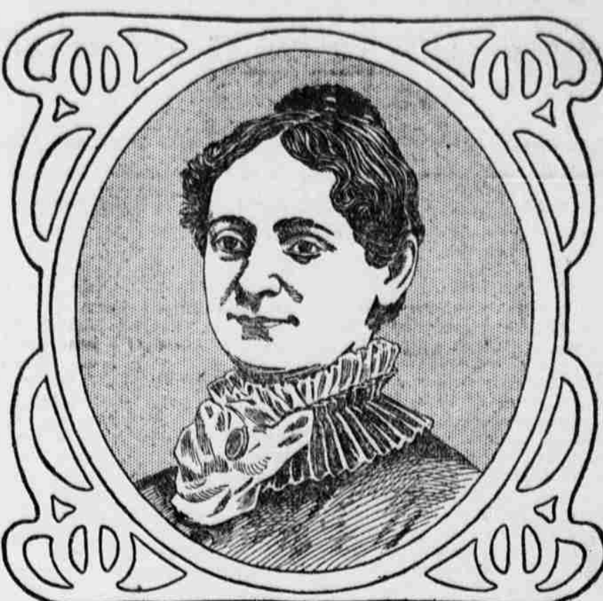
LYDIA E. PINKHAM

Of Lydia E. Pinkham's Vegetable Compound, the Great Woman's Remedy for Woman's Ills.