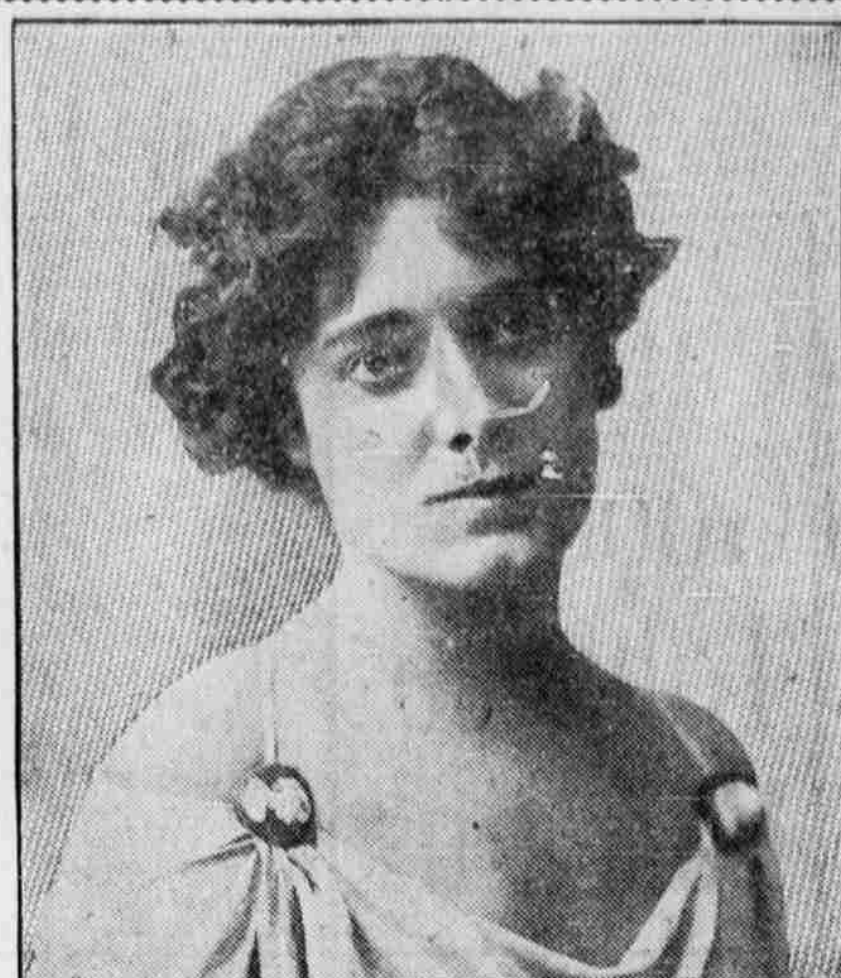
MISS JULIA MARLOWE Heartily Approves of Peruna for the Nerves.

In a recent letter to The Peruna Medicine Co., Miss Julia Marlowe, of New York City, writes the following: