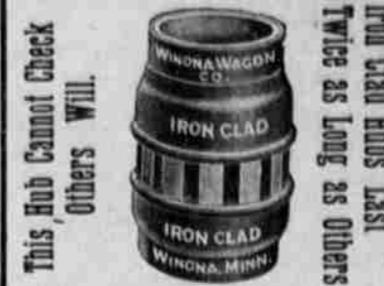
Iron Clad Hubs Last Twice as Long as Others

See Announcement Vote Contest Elsewhere in this Paper