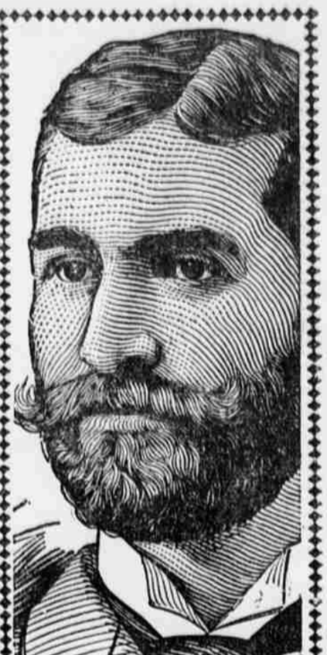
Dr. Llewellyn Jordan, Medical Examiner United States Treasury.

Peruna occupies a unique position in medical science. It is the only internal systemic cathartic remedy known to the medical profession to-day. Catarrh, as everyone will admit, is the cause of one-half the disease which afflicts mankind. Catarrh and catarrhal diseases afflict one-half of the people of the United States.