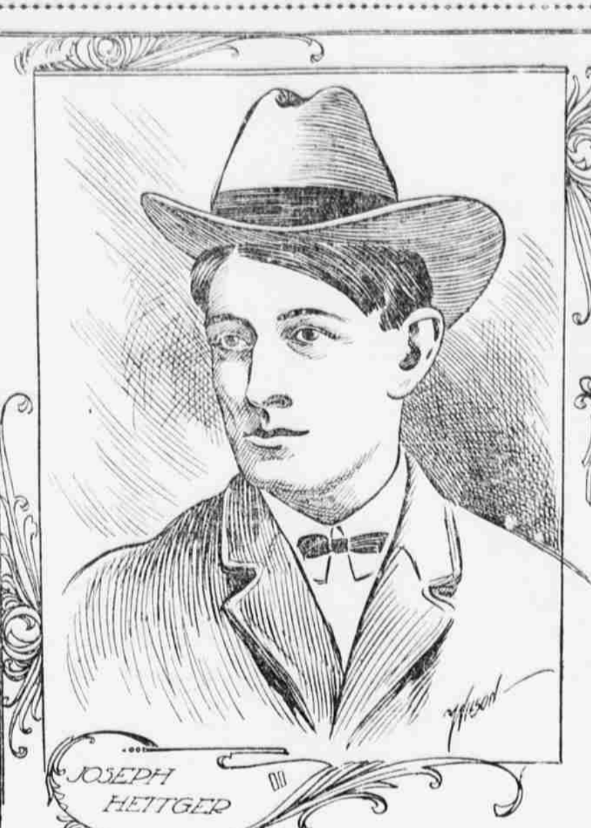
Indiana University man who has been questioned by the police as to his knowledge of events connected with the Schafer murder.