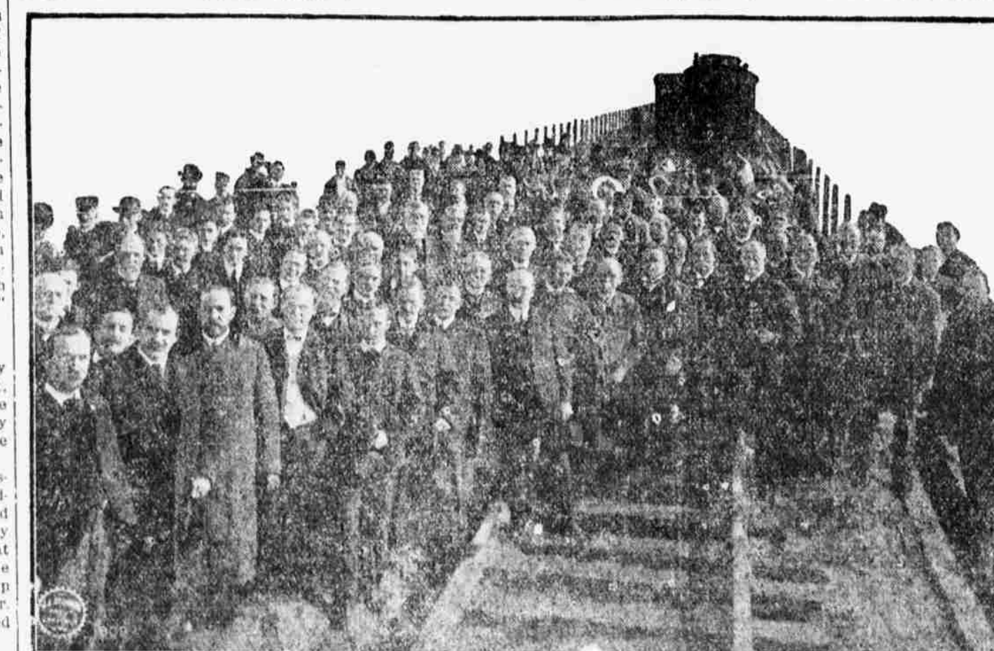
Railroad Officials at Formal Opening of the Ogden-Lucin "Cut-Off."

ing the last week of October. This great work has cost over $4,200,000.