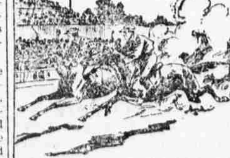
A CLOSE FINISH.

Two preliminary races give the crowd an opportunity to size itself up