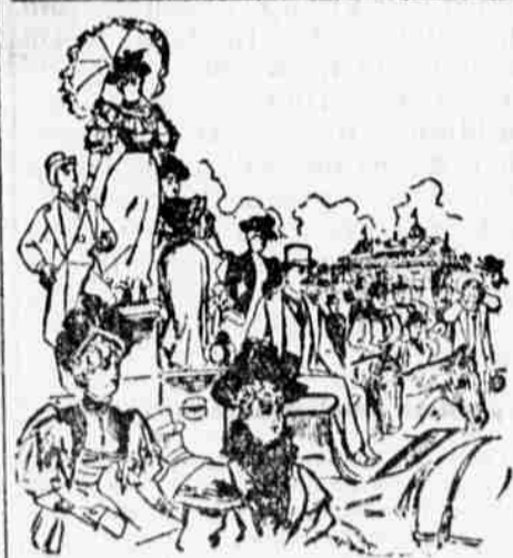
IN THE INFELD.

to show that they are of real Derby caliber. It is the best horse to win, and naught could tempt owner, trainer or jockey from the strictest line of honesty. Even royalty has been represented among owners who prize a