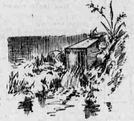
DURABLE TILE OUTLET.

The outlet should also be kept clean of roots and bars of netting so placed that the vermin may be kept out. If this is done and the tile properly laid,