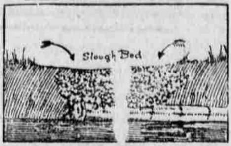
WELL-MADE TILE INLET.

No one will question the value of tile for drainage pipes. In laying head end of tile, it is a mistake to dump in a few pieces of broken tile and mud dug from the slough bed with the idea of packing to make nearly waterproof. Many have done that in this section and the water,