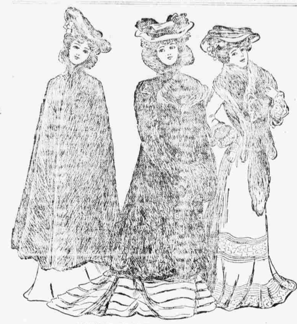
SETTLED ON AS BEYOND CRITICISM.

closed, though a few minor changes are is a welcome change. noticeable. As first put forward the Simple tailor shirt waists of plaid and rule was for dark furs in the street, with checked silks are shown in the spring few minutes after the fire began [nurtied him in regard to the subject, between Chadron and Long Pine, white and light colored ones indoors. In models. Shirt waists for ordinary wear there was a loud explosion that blew But he would discuss the matter only general this still holds, but a deal of er- are of soft cloths and challies. Wash out the front of the store and hurled when in a reminiscent mood brought wering the Spaniard's description of G. M. Burlingame, who will now mine is seen in street get-ups, often in tuffetas, corded Japanese and wash silks showy revers and collars. Indoors more are also shown for next season. Both of ermine is seen, and a deal of miniver | colorings and quality of materials are no-