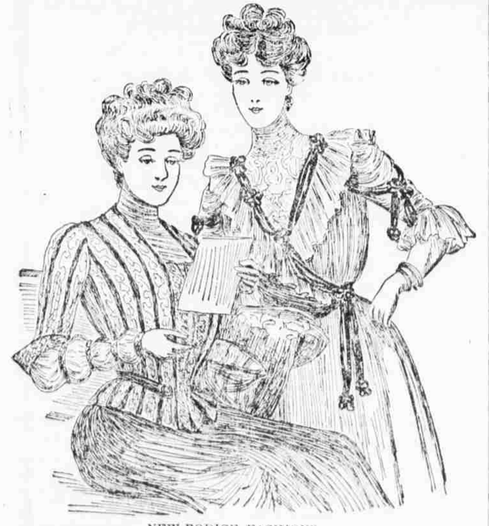
NEW BODICE FASHIONS.

here, muff, revers and collar were chin- the fail. Embroldered fronts are not chilla. Russian sable is as fine, as costly shown and will probably not be worn, and as stylish as a year ago, yet so much Fichus, bretelles and ruffles are put on of it is now worn by fashionable women the new models. In addition to simple that they may shift to something else by fichus of frilled white chiffon, which alanother winter. Perhaps sealskin may ways retain a certain stylishness, there tal. be revived to replace it. A handsome are charming new designs that show