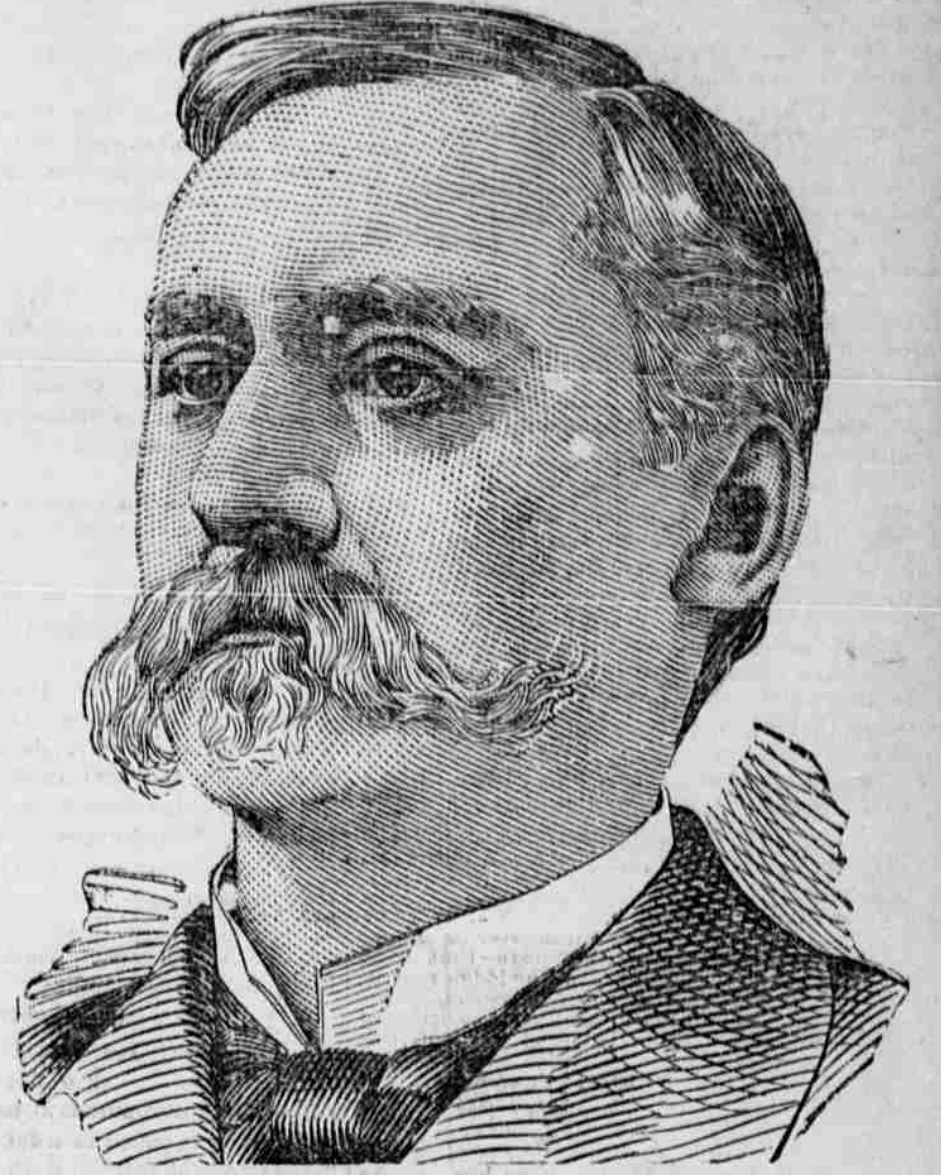
Hon. W. N. Roach, United States Senator from North Dakota.

Says Peruna, the Catarrh Cure, Gives Strength and Appetite.