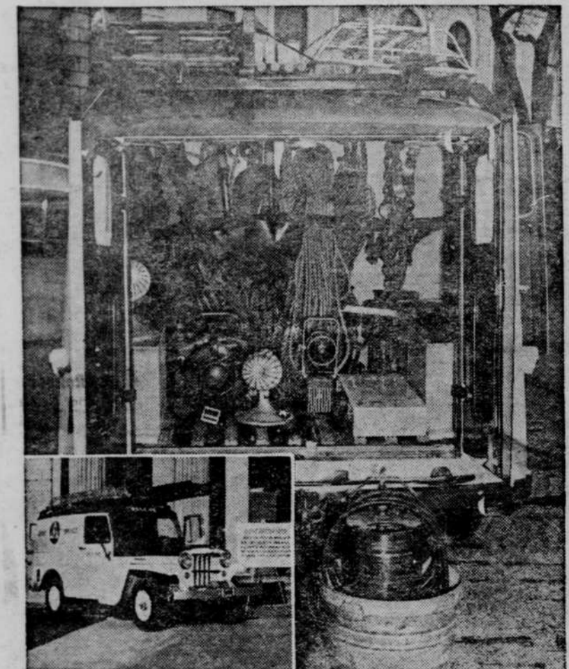
LIGHT RESCUE TRUCK (inset) especially suited to rural rescue work is now being tested by the Federal Civil Defense Administration. It packs a collection of multiple-purpose rescue tools including ropes, block and tackle, floodlights, a small generator, a hand pump (all shown above), an inhalator, and radiation detection instruments. The truck, costing a third of FCDA's $10,000 rescue truck, can cross open country in four-wheel drive in any weather.

Now... New "King-Size" joins the world's most famous bottle!