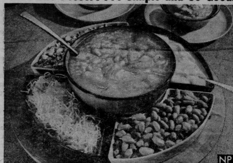
Apple Sauce Buffet

COME ONE, COME ALL and help yourselves to this dessert! Apple Sauce Buffet is so simple, it belongs in the "why didn't someone think of this before" category. And it's so good tasting, everyone will enjoy it.