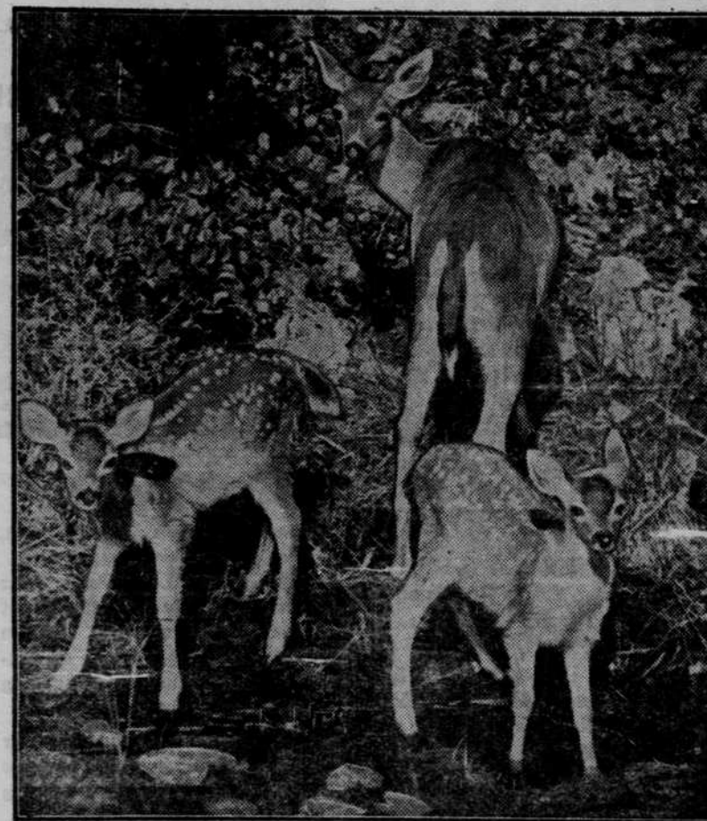
TWIN FAWNS , Jack and Jill, pose prettily with their mama at the edge of a pond in the Muskoka Lake District of Ontario. The Muskoka chain of lakes, sometimes termed the "English Lake District of Canada", extends almost 50 miles northwest from Gravenhurst to Lake Joseph, some 100 miles north of Toronto.