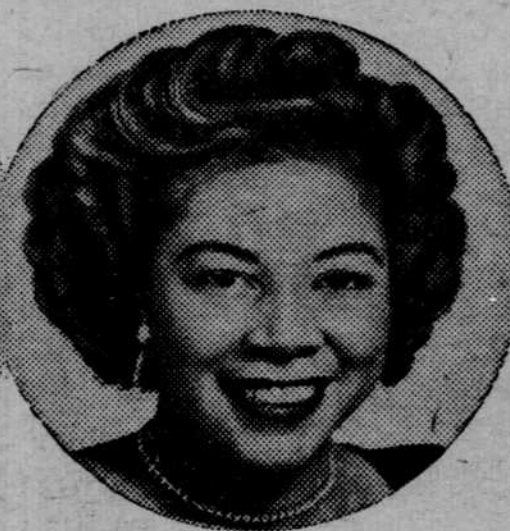
No. 751—Feather Halo Curls —a thick, open-crowned circlet that gives you height, smartness! Created of double-wavy human hair to match your hair color, and made to your order, as are all Howard hairpieces. $9.00.