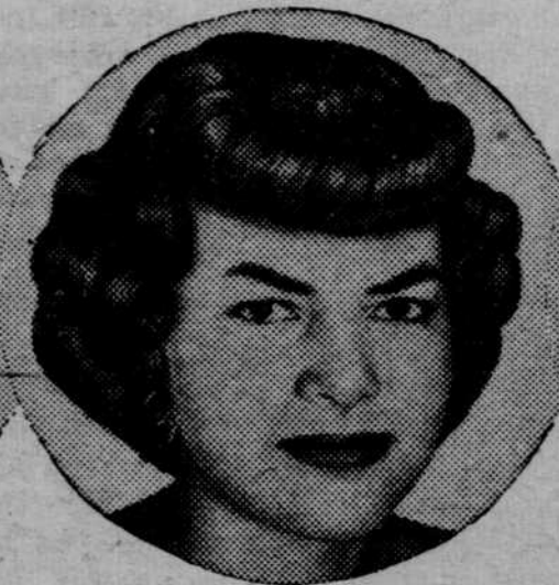
No. 9125—Fascination —a full transformation of fine human hair, made to order for the woman who needs a full wig, and wants simple, youthful charm. Without part, as shown. (To order, measure around your head from nape of neck over ears and forehead and give us your headsize in inches.) $27.50.