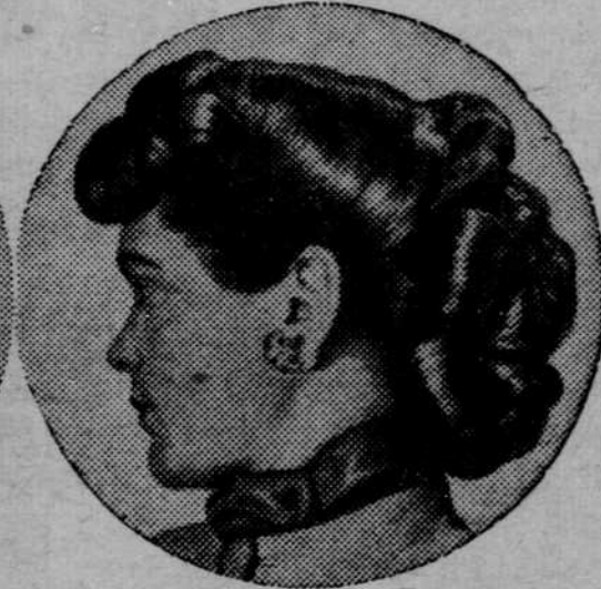
No. 712—Glamour Bob-Curls with Bangs —a one-piece, quarter-lined real hair coiffure that you'll wear a dozen ways and all of them charmingly. Your own hair brushes up on each side. Made to match your hair color perfectly. $16.00.