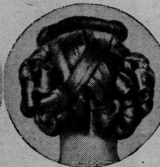
No. 636—Twin Curl Clusters —the very newest hairdo magic for short, short hair: two 4" gleaming corkscrew curl clusters that pin on in a twinkling and lend a brand-new charm to your face; $11.00 the pair, or $5.50 each, made to order.