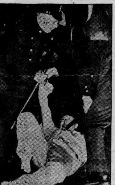
NEW YORK — (Soundphoto)—One of the pickets is down on the pavement in the riot which broke out last night in front of the Roxy theatre here at the scheduled opening of the picture "The Iron Curtain." Opposing pickets lines, one against the movie showing and the other, consisting of Catholic War Veterans, for it, tangled in a melee that required the use of police reserves to quell.