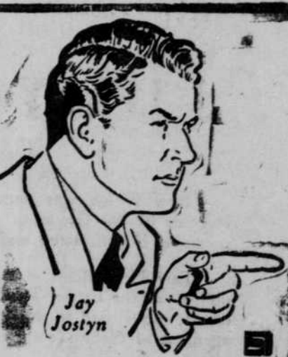
"MR. DISTRICT ATTORNEY" Says—

Fat Salvage Pays Off Thirty women, aware of the urgent need for salvaged fats, have found a means to make their resourcefulness pay dividends. Selling their used fats to meat dealers augments their household allowances.