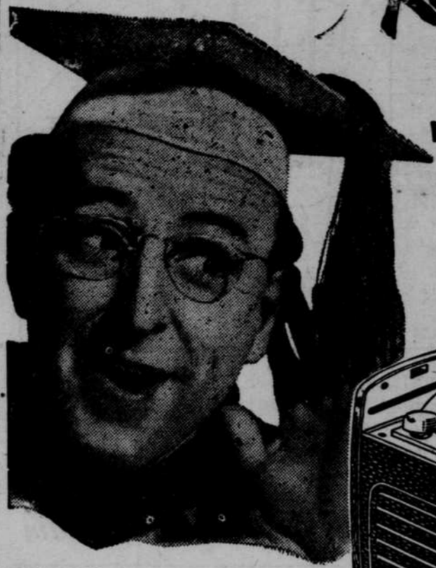
KAY KYSER, professor of the "College of Musical Knowledge" heard each Wednesday over NBC.

because it renews its power over and over