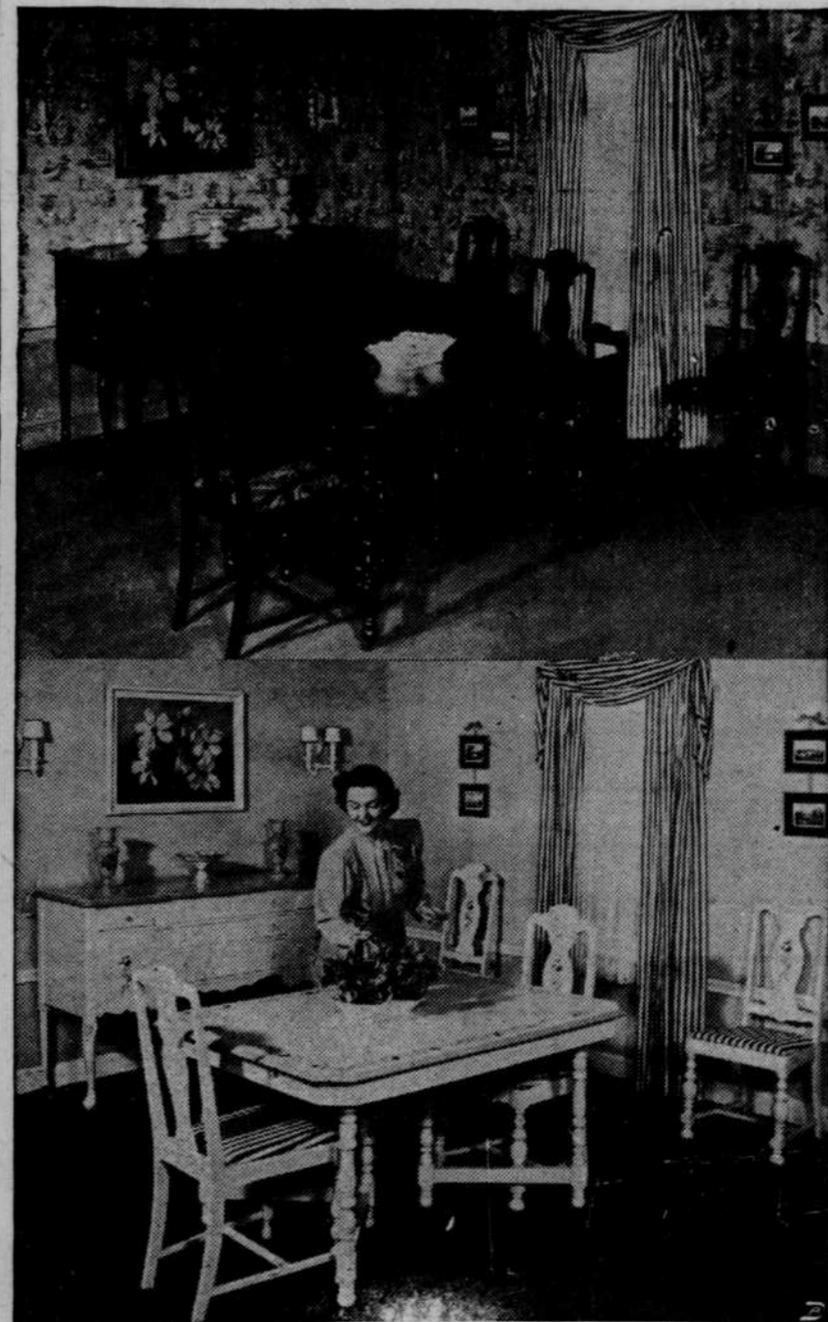
TOP PHOTO—This drab, dingy wall-paper and dark furniture... BOTTOM PHOTO—After a few days work... dinged looked like this. A single wall-paper and two... ness to the old fash-

Start of Soup Kitchens Soup kitchens for needy children were started in Germany in 1790 when Count Rumford invited hungry children to his municipal "bread line" in Munich.