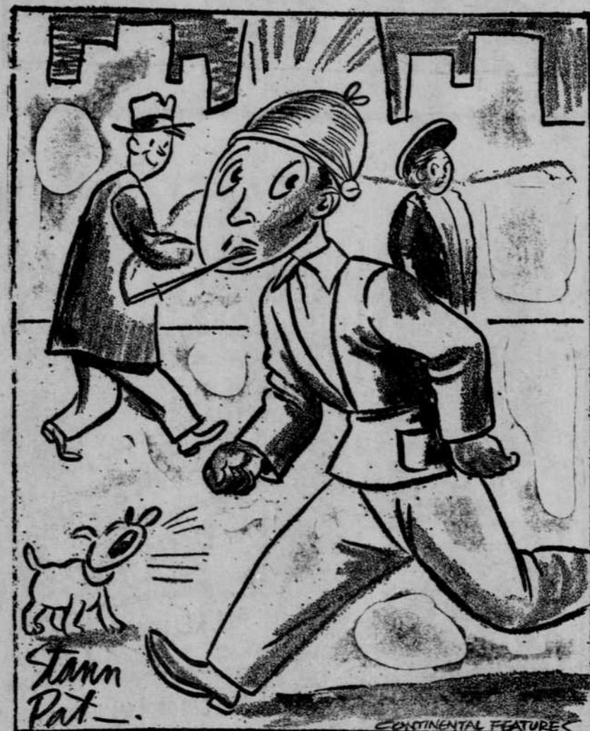
Don'ts: Honest, Chum, That's Not the Chapeaux For Street Wear.

Oriental Rug Colors The colors and forms of nature have been the inspiration of weavers of Oriental rugs through the ages. Because of this the basic colors and fundamental designs of Oriental rugs have a fresh feeling which, as one decorator points out, imparts a touch of warmth and hominess to modern interiors.