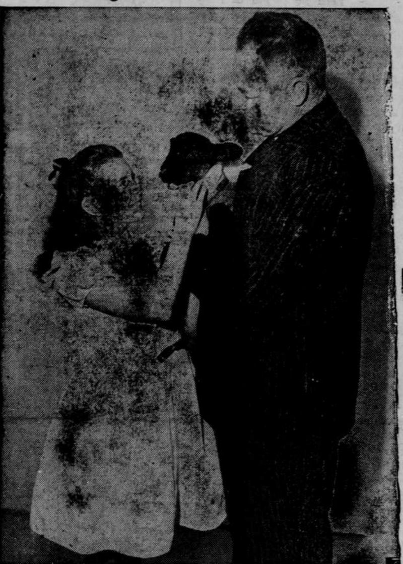
HOLLYWOOD—Margaret O'Brien, child movie star, receives gift of a lamb from wool growers of the world.