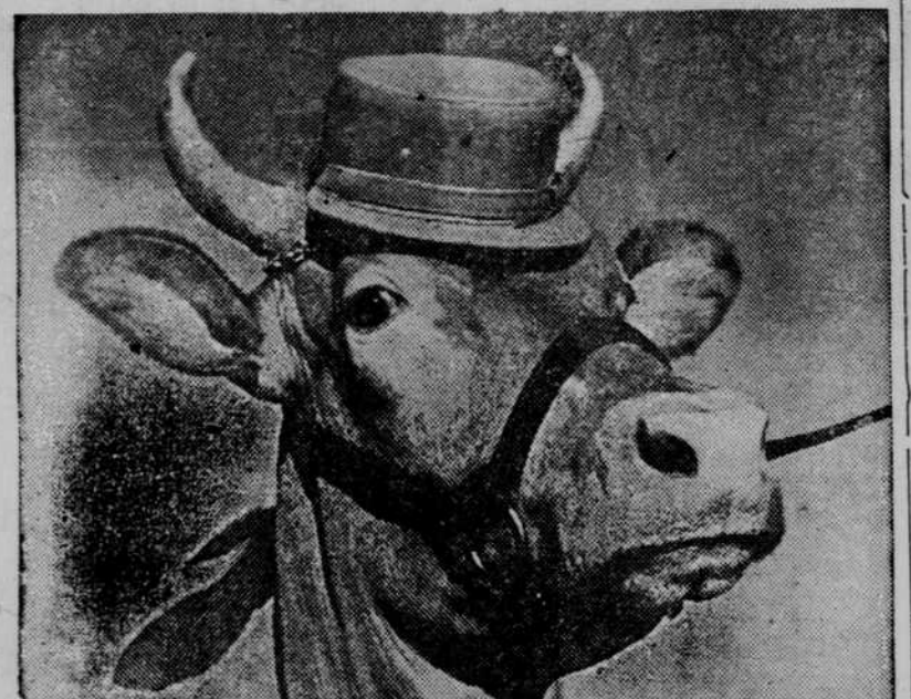
MILWAUKEE—Curtiss Candy LeVity Destiny tries on a hat at the Wisconsin State Fair. But such sideline activities did not keep her from becoming first prize two-year-old Guernsey cow at the Wisconsin, Illinois, Indiana, Minnesota and Kentucky state fairs this year. LeVity Destiny was a member of the prize-winning Guernsey string owned and shown by the Curtiss Candy Company Farms, Cary, Ill., that won 21 championships and 72 blue ribbons at the five fairs.