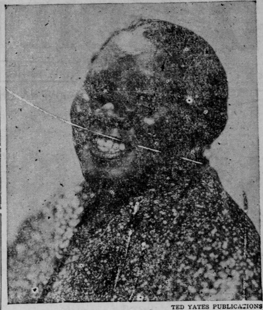
Hattie McDaniel, famous Negro actress, has been cast in a featured role in Republic's big-budget production, "The Flame," which will co-star John Carroll, Vera Ralston, Robert Paige and Broderick Crawford.