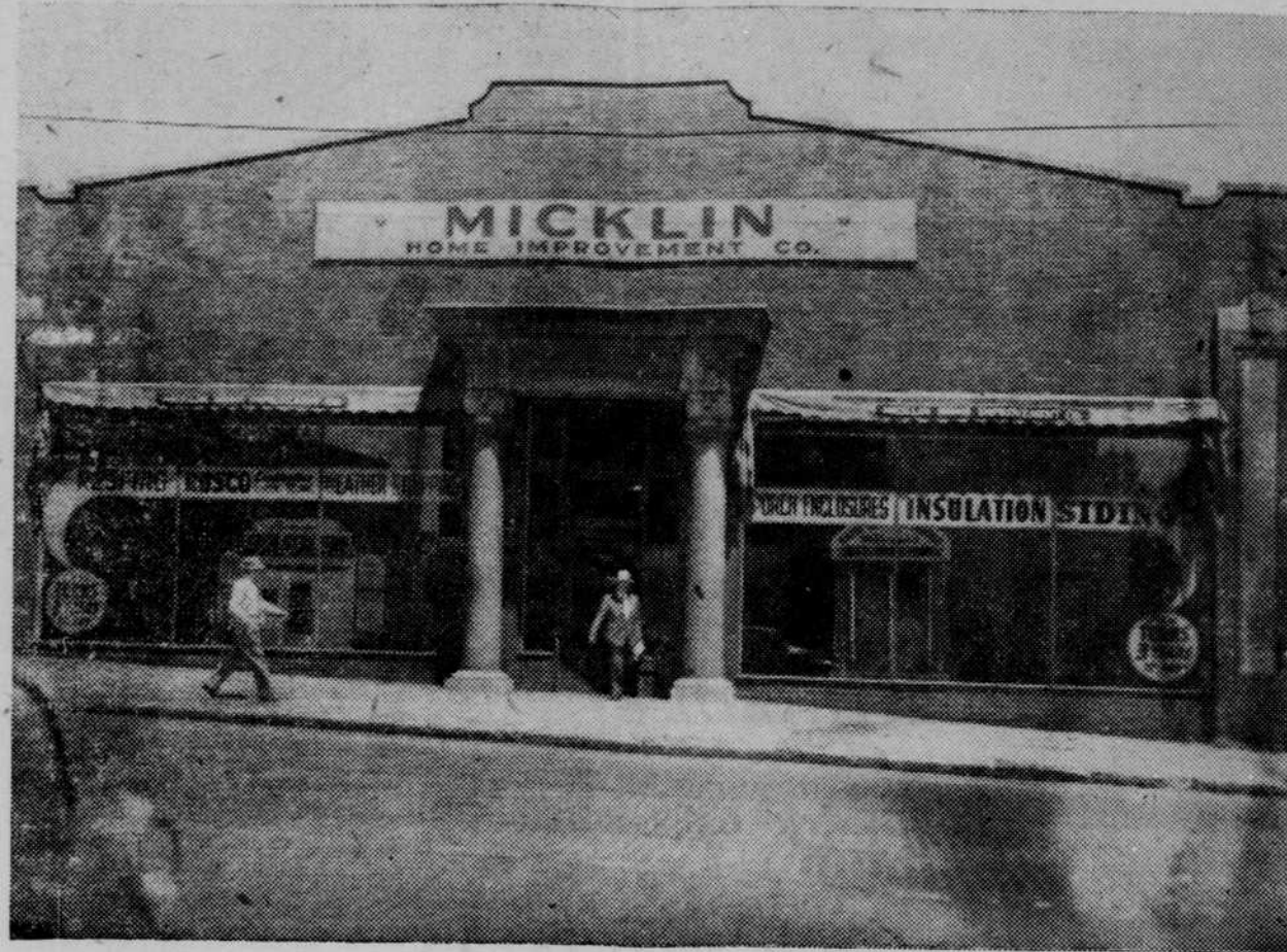
17th and Farnam