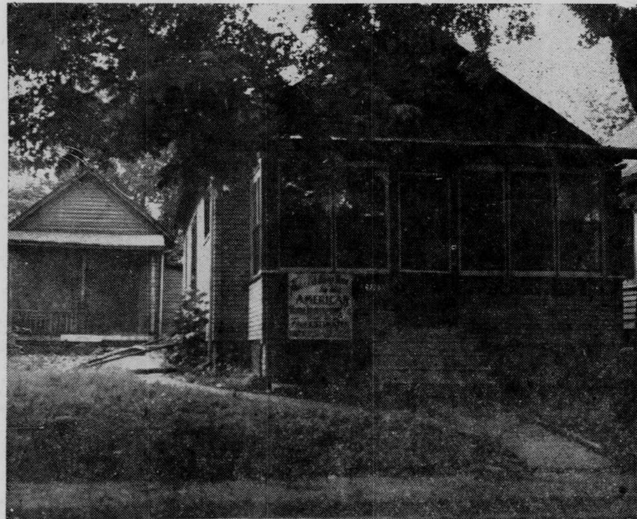
2220 No. 25th Street